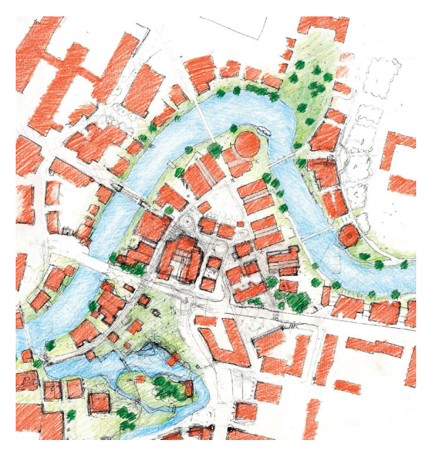
Future plan with university and research blocks mixed with urban blocks on both sides of the creek.